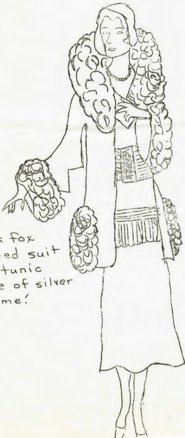
Black fox trimmed suit with tunic blouse of silver lame!

These fashions are from the December issue of Woman's Home Companion, 1930.