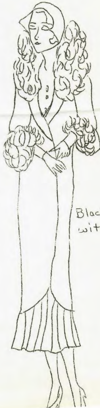
Black velveteen with black fox trim.